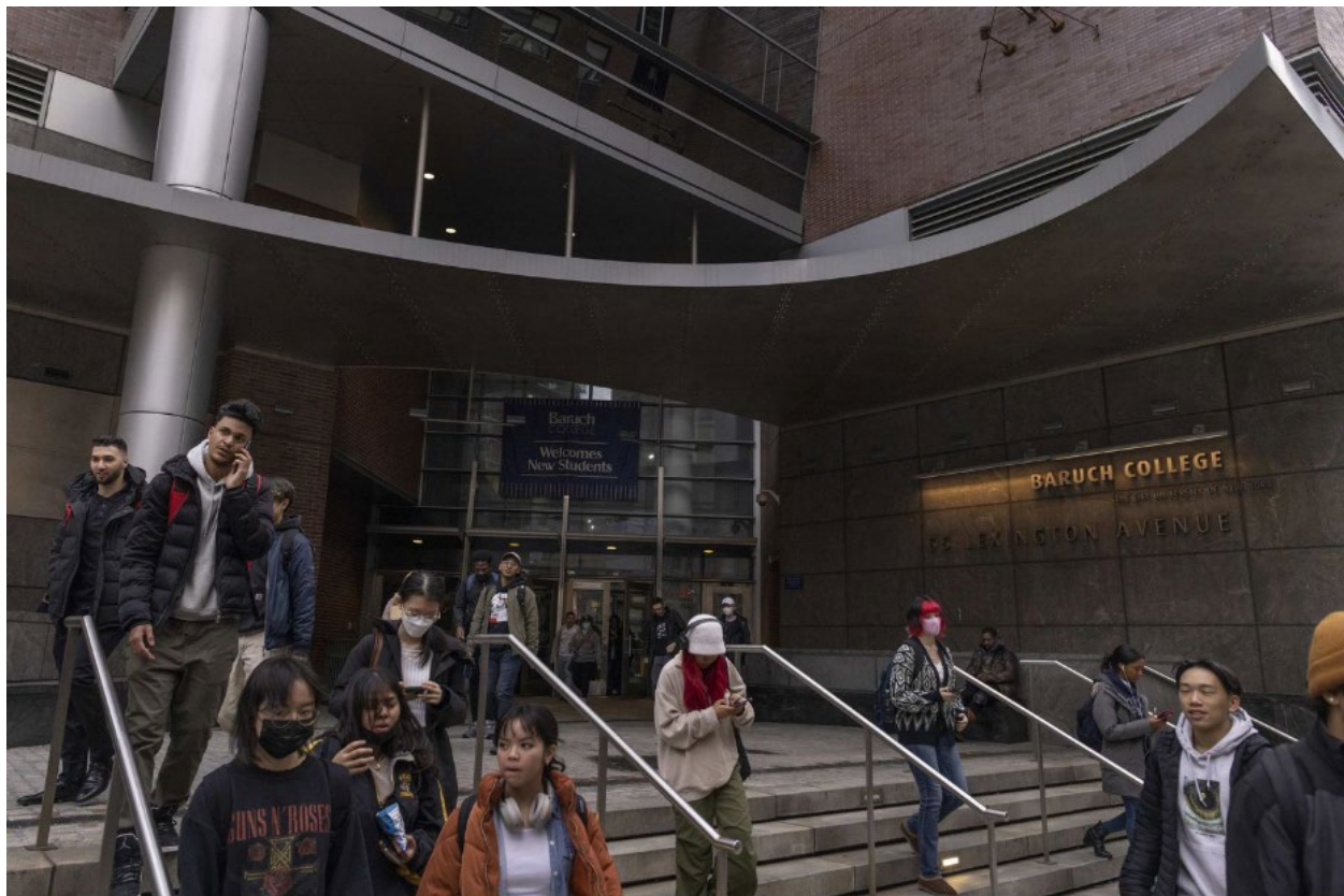
Students leave the Baruch College campus in New York.