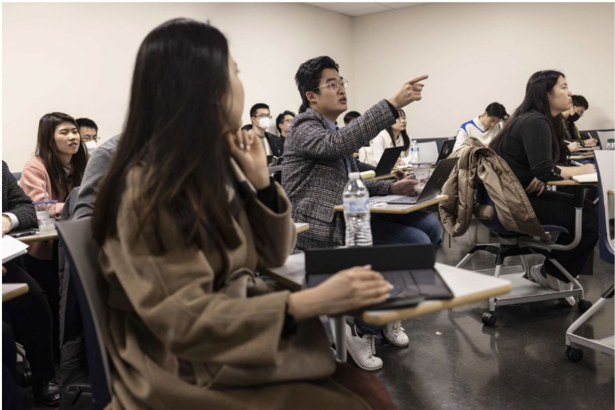
Students during a class in the Financial Engineering Masters Program.

Baruch, it turns out, has built a pipeline to Wall Street that rivals those at many richer, more prestigious institutions. Its faculty includes pros from the likes of Goldman Sachs Group Inc. and JPMorgan Chase & Co. Its students routinely graduate into six-figure jobs at big banks or, more likely, head to hedge funds such as Citadel and Millennium Management.